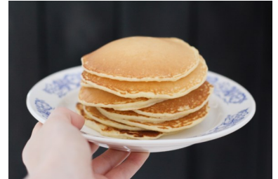
Free Pancake Breakfast